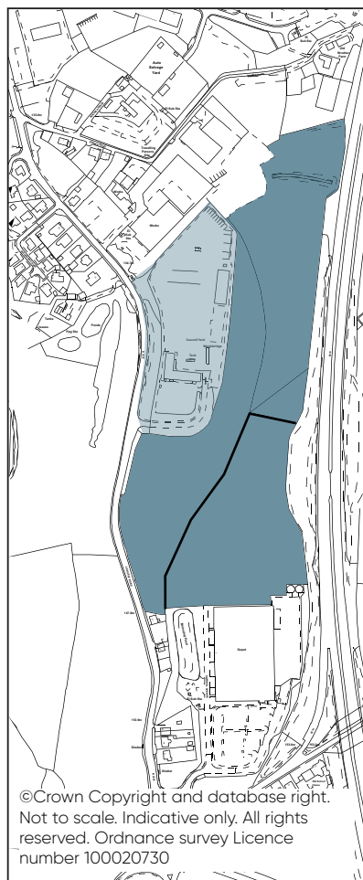
©Crown Copyright and database right. Not to scale. Indicative only. All rights reserved. Ordnance survey Licence number 100020730